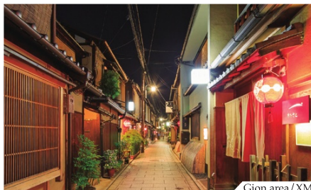
Gion area / XM