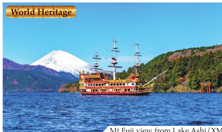
Mt.Fuji view from Lake Ashi / XM