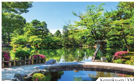
Kenroku-en / XM