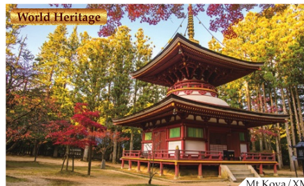
Mt.Koya / XM