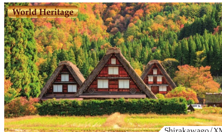
Shirakawago / XM