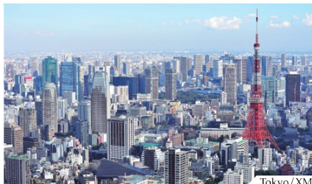
Tokyo / XM